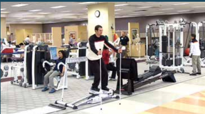
Campaign for Excellence supports facilities and programs within Centers for Rehabilitation and Wellness