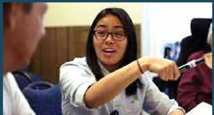
Philanthropy supports growth of St. Jude's innovative and comprehensive communication recovery programs