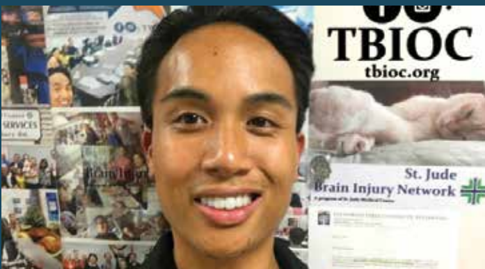
Educational assistance enables St. Jude service coordinator to achieve brain injury specialist certification