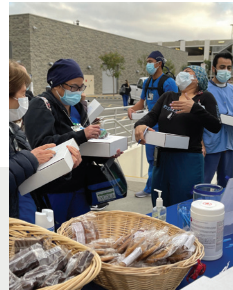
Providence St. Jude caregivers overwhelmed with gratitude for their care packages